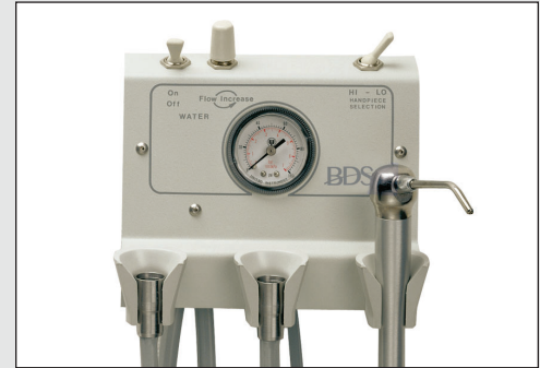
Dimensions (w x h x d) 6 1/8" x 5 3/4" x 3 1/2"