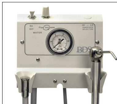
Unit head dimensions (w x h x d) 6 1/8" x 5 3/4" x 3 1/2"