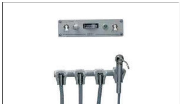
Panel mount dimensions (w x h x d) 7½" x 2" x 5⅞"