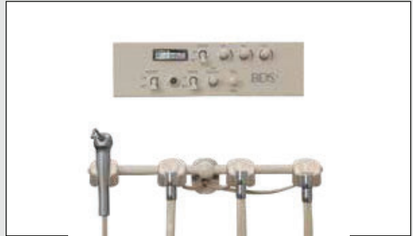
Panel mount dimensions (w x h x d) 9¾" x 2¾" x 9⅞"