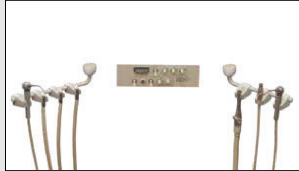
Panel mount dimensions (w x h x d) 9¾" x 2¾" x 9⅞"