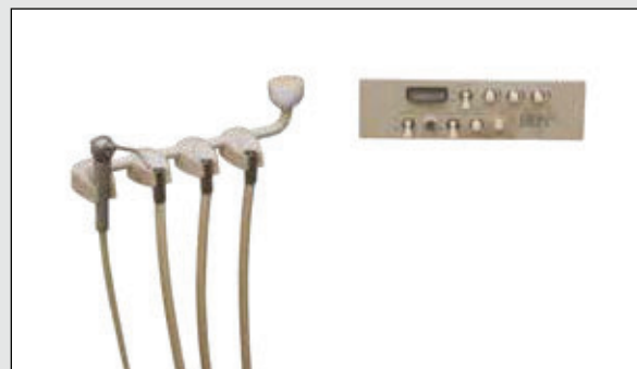
Panel mount dimensions (w x h x d) 9¾" x 2¾" x 9⅞"