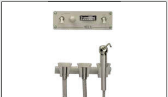
Panel mount dimensions (w x h x d) 6⅜" x 2" x 5⅞"