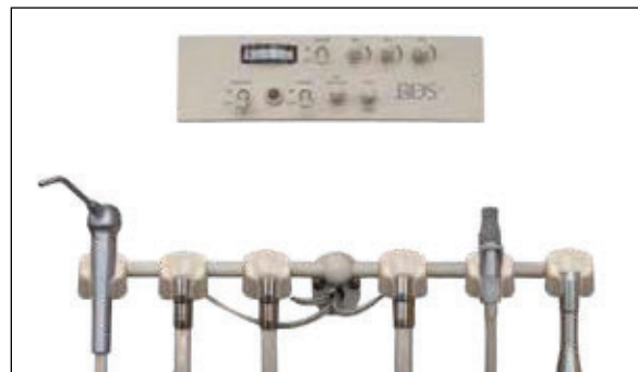
Panel mount dimensions (w x h x d) 9¾" x 2¾" x 9⅞"