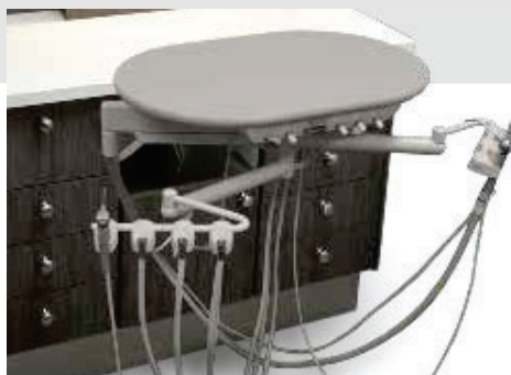
106-400 arm 101-116 top RD-3150 unit