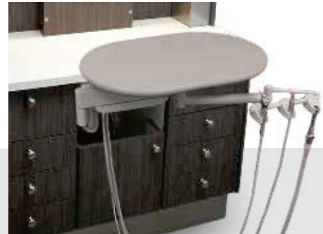
106-400 arm 101-116 top 105-477 vacuum system