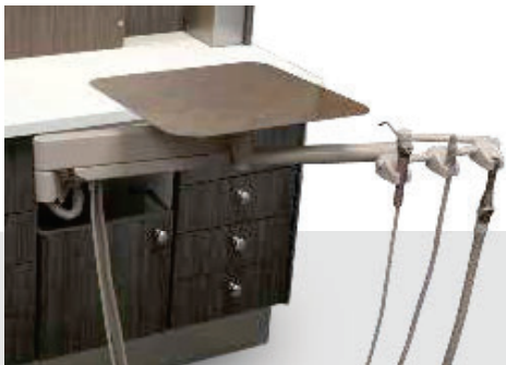
106-400 arm 103-335 top 105-477 vacuum system